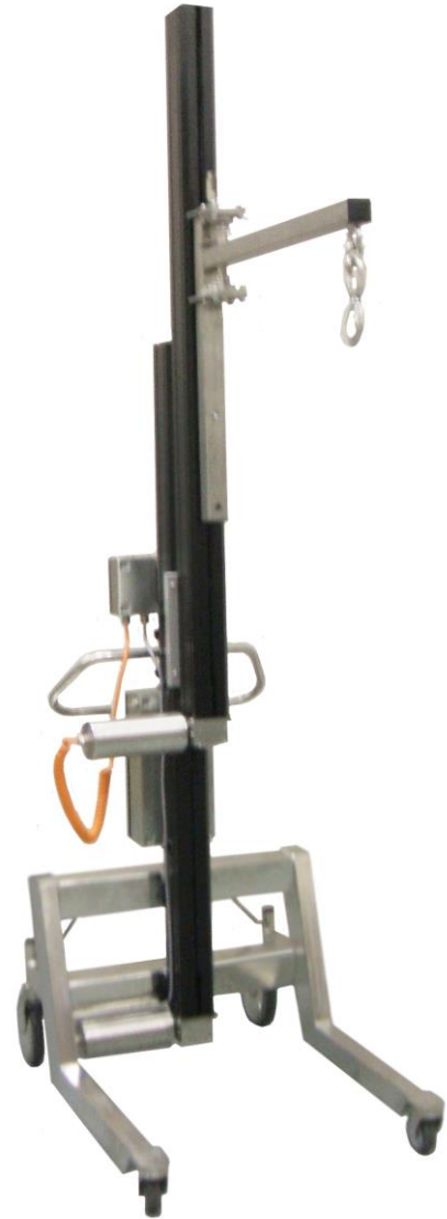
Telescopic Mast Swivel Arm with Lifting Hook