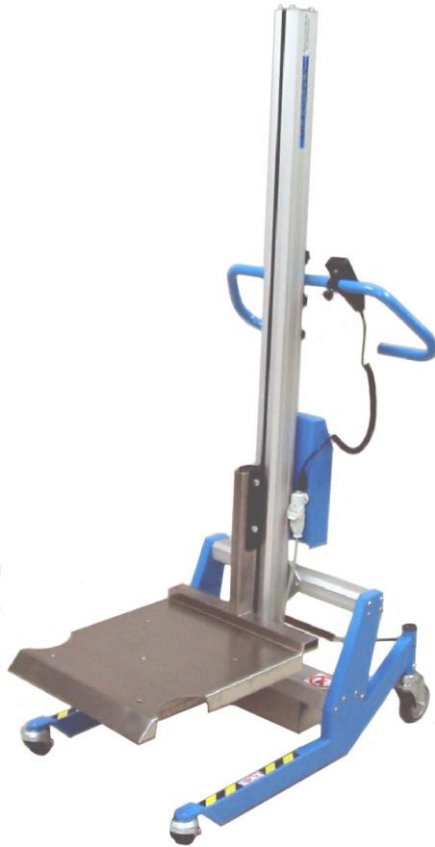
Powder Coated Paint Version Shown