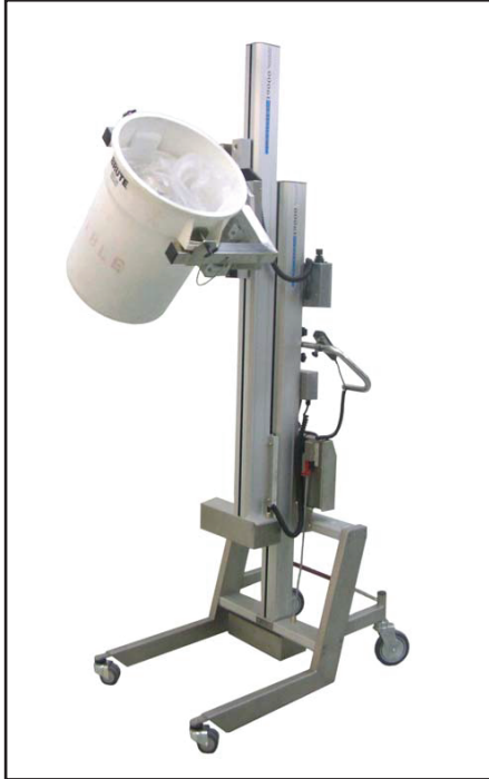
“BRUTE” Rotating- 19000 Series Lifter with Telescopic Mast-Pickup from Floor