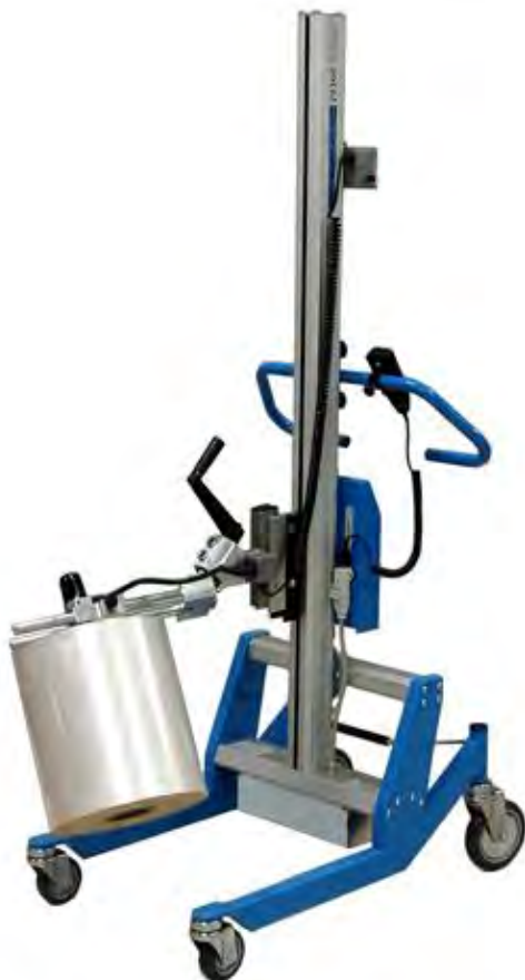
3" Electric Expand-O-Turn™

The Expand-O-Turn® expander is operated via pushbuttons and is simple and easy to use and will not damage the core or the roll surface.