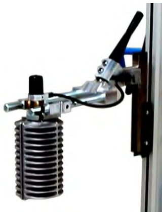
6" Electric Expand-O-Turn